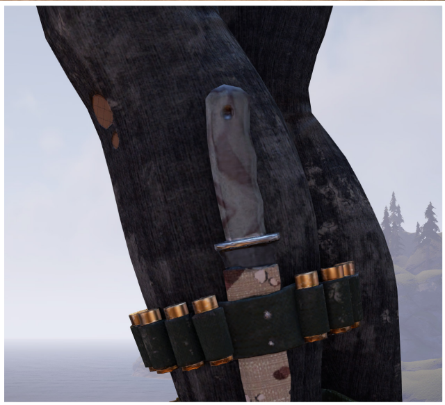
KNIFE AND BULLETS