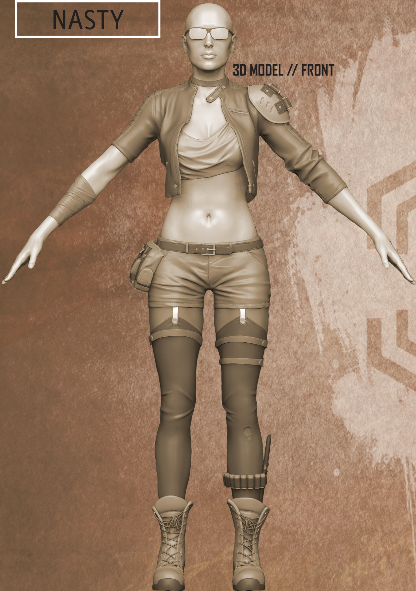
3D MODEL // FRONT