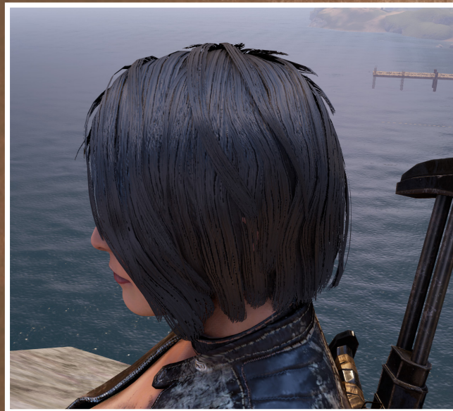
HAIRSTYLE: SIDE CUT