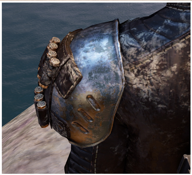
SHOULDER ARMOR // BACK