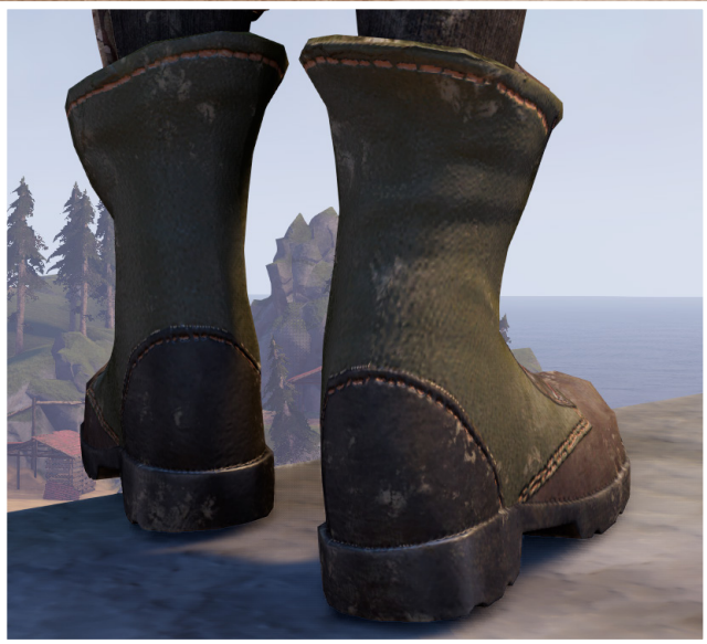
BOOTS // BACK