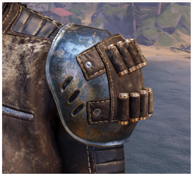
SHOULDER ARMOR // FRONT