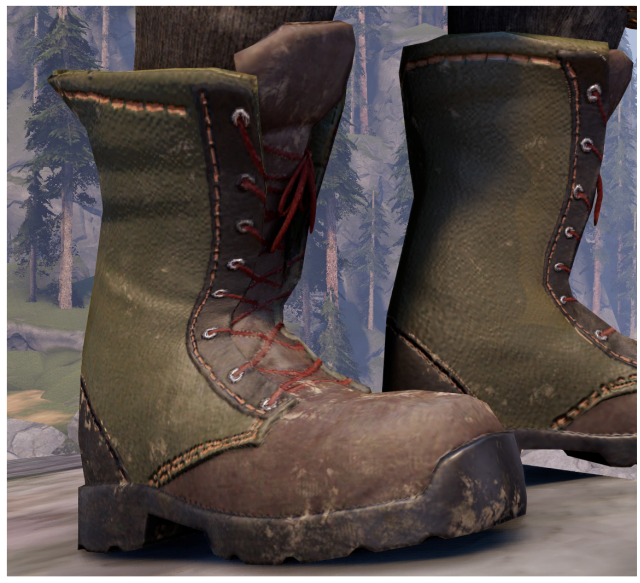
BOOTS // FRONT