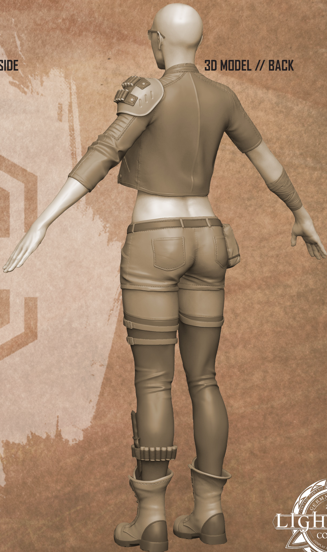
3D MODEL // BACK